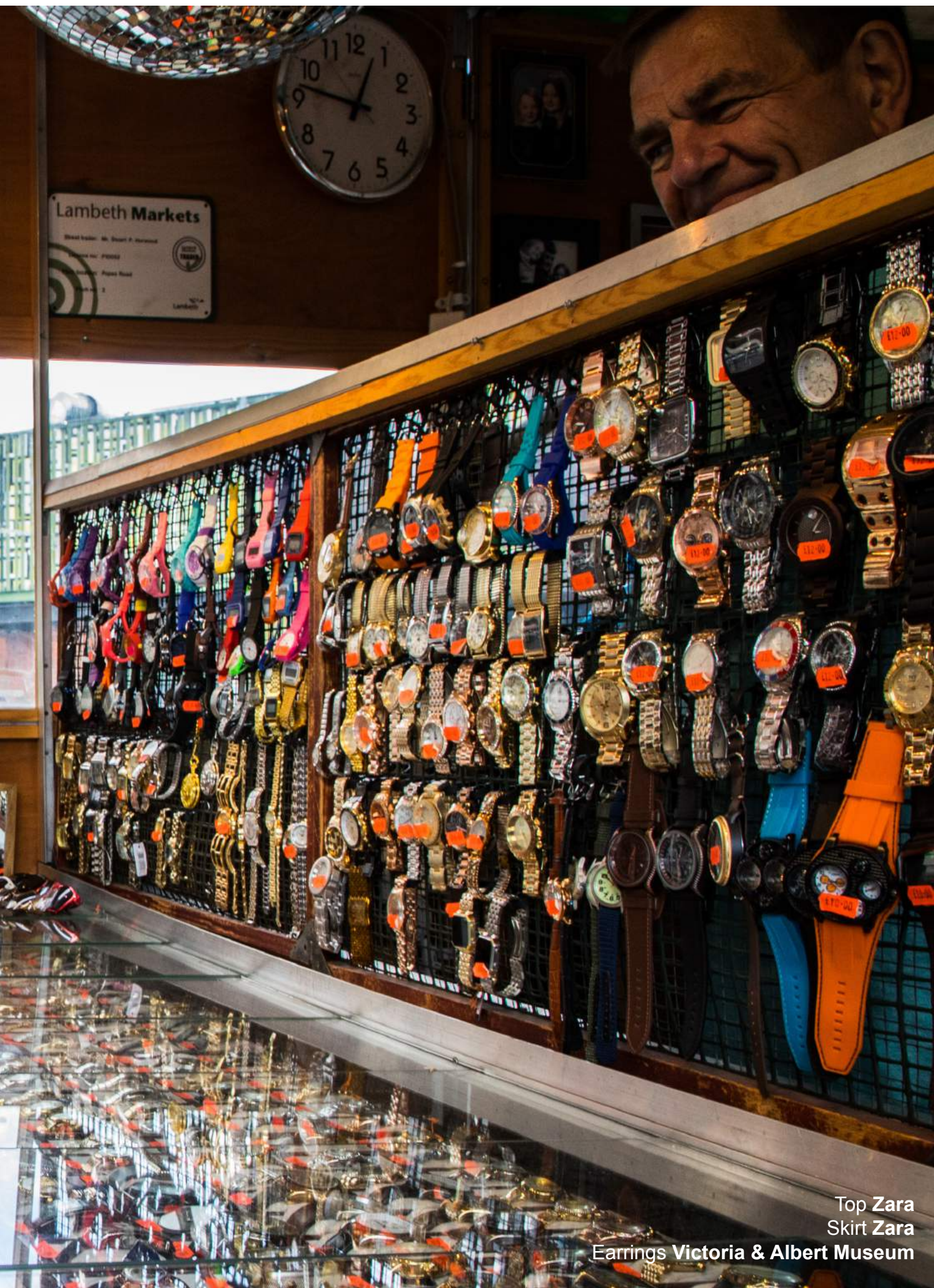
Top Zara Skirt Zara Earrings Victoria & Albert Museum